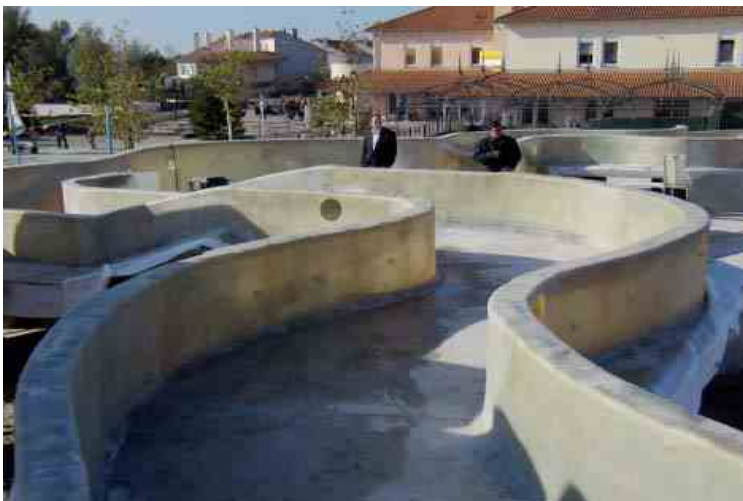
Installation Center Parcs, Port Zélande

This novel system offers planners and operators completely new possibilities for every water park.