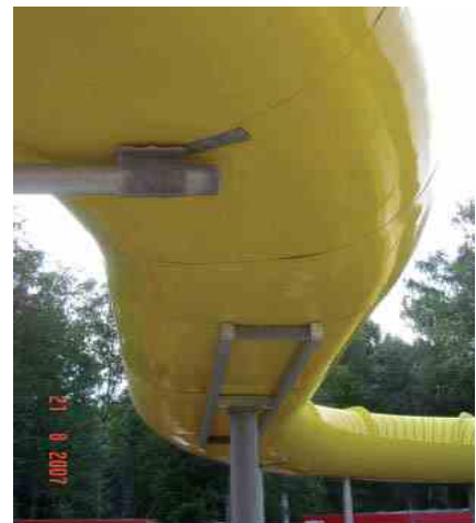
Magic Eye® Avesta

We used the new insulation material for the first time in our Magic Eye® water slide in the thermal water park in Avesta, Sweden. The Magic Eye® includes full thermal insulation on the lower shell. This considerably contributes to energy savings and a pleasant exterior appearance.