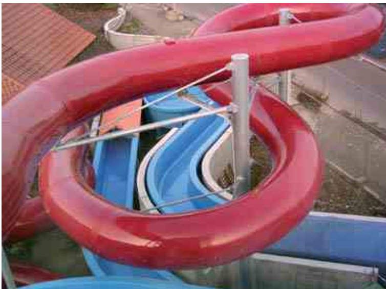
Tube Slide with outer shell and White Water River in Weil am Rhein /Germany

A cleverly devised system, comprising an outer shell and waterproof insulating material between the slide and the shell, has made it possible to lower the K-value of a tube slide from normally 5.10 W/m 2 K to approximately 0.49 W/m 2 K. In addition, the slide lined with this material no longer features any flanges facing to the outside, and the exterior surface is smooth and shiny . The removable outer shell enables easy maintenance in the relevant locations, for example for the lighting effects.