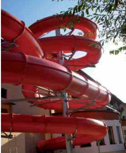
Tube Slide Hotel Mozart Ried / Austria

An increasing number of operators of children's hotels common in Austria are interested in the system klarer water slides. Just recently, a 120-metre long tube slide was completed for the Mozart Ried Hotel in Austria.