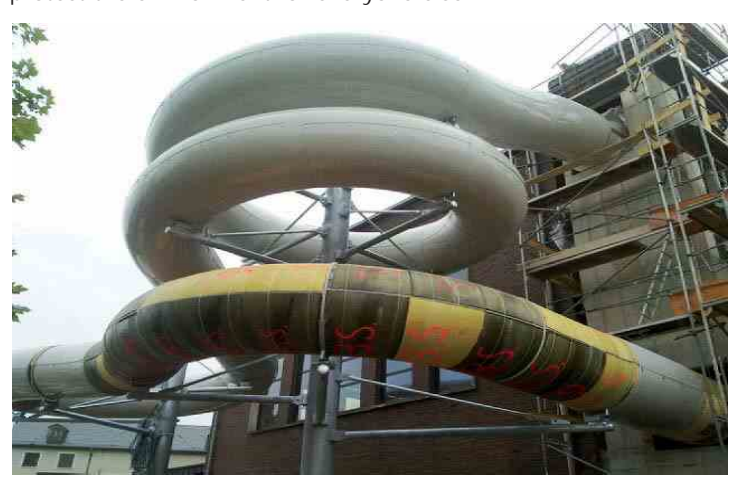
A contribution to energy saving is the heat insulation from Klarer.

Energy saving measures not only serve to lower costs, they also protect the environment for everyone else.