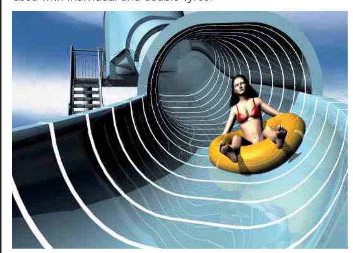
The Magic Tube is also available as an open variety , the Magic Slide .

Due to the compact dimensions the Magic Tube offers even more opportunities for baths that don't have much space and can be used with individual and double tyres.